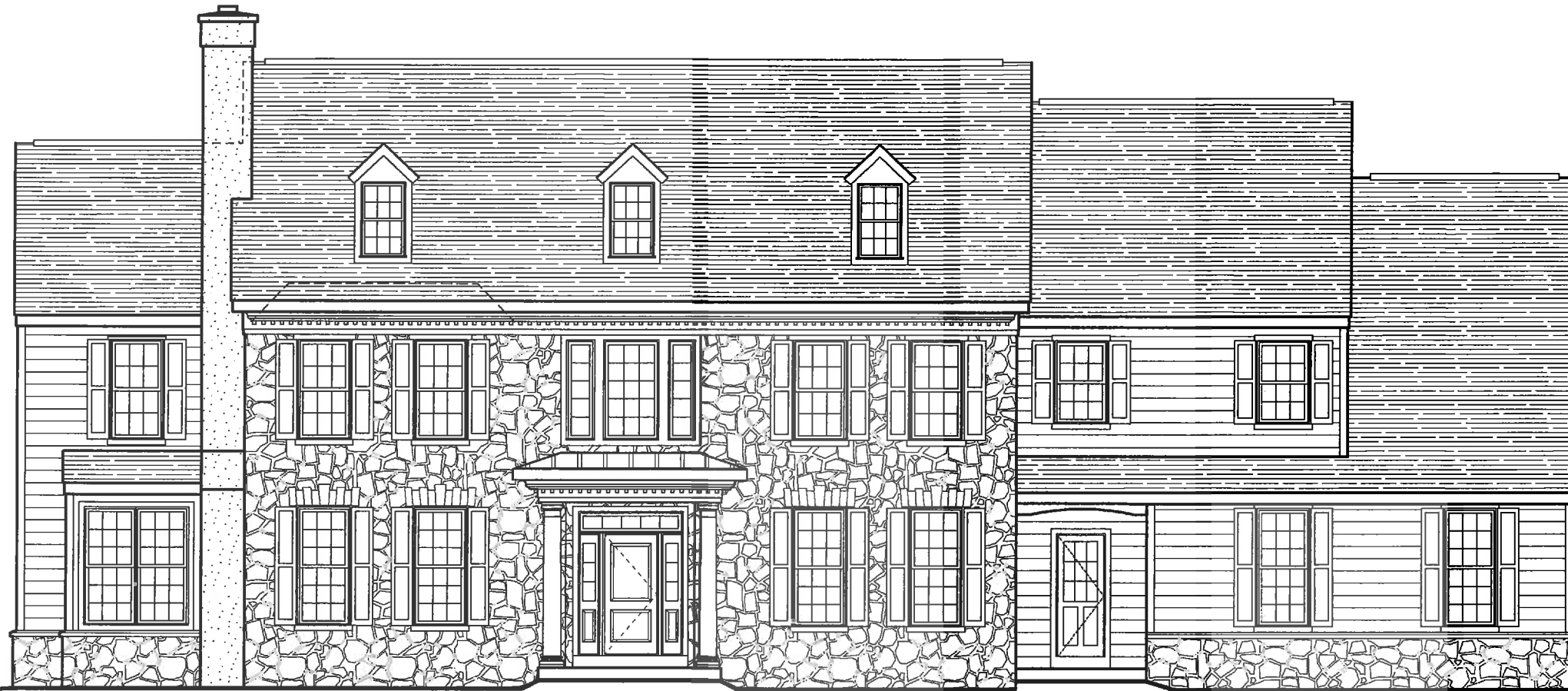
FRONT ELEVATION 1/4" = 1' - 0" I:\boc\132\101r.d\front.dwg